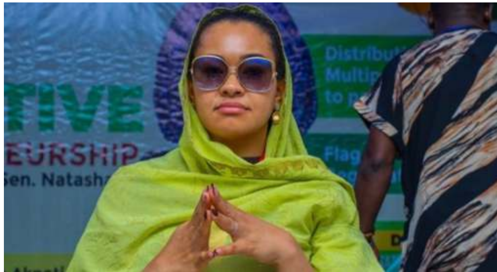
Kogi Central Senatorial District.

The INEC statement read in part, "The commission held its regular weekly meeting today, Tuesday, 25th March 2025. Among other issues, the meeting discussed the petition for the recall of the Senator representing