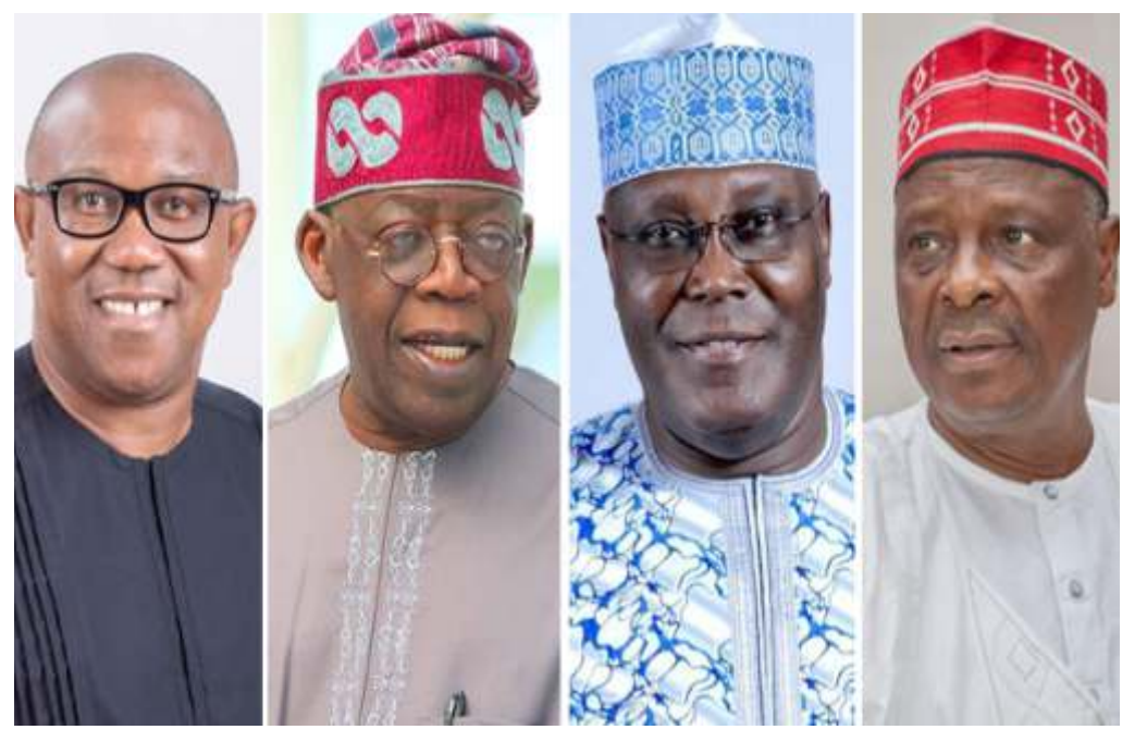
formalizes its structure.

The primary objective of the coalition is to consolidate opposition forces and present a credible alternative to the ruling party. However, the question of who will emerge as the coalition's presidential candidate remains unresolved and is expected to be decided through internal primaries once the coalition