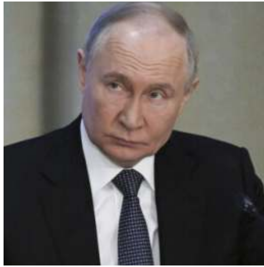
energy facilities and critical infrastructure, Ukraine's defence ministersaid.

The Ukrainian and US delegations on Sunday discussed proposals to protect