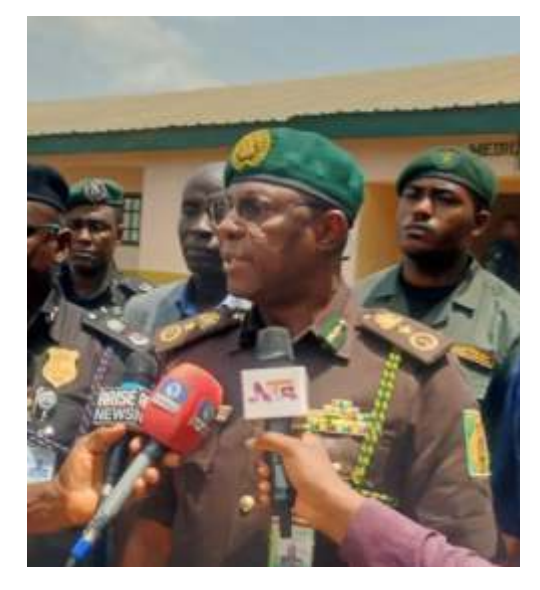
investigation had been launched to

Umar said efforts are being made to recapture the remaining 10 inmates. Umar assured that a comprehensive