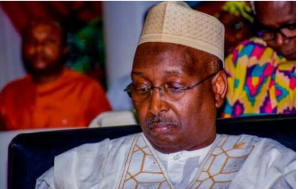
framework for contesting the 2027 elections, and other relevant matters.

"Once concluded, formal announcements will be made with all the details regarding the composition of membership, the program of action for 2027, the