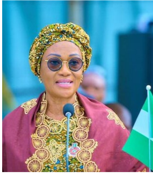
She joins the eight-member Steering Committee as one of two representatives

Her election took place during the 29th Ordinary General Assembly of OAFLAD, currently ongoing in Addis Ababa, on the sidelines of the 38th Ordinary Session of the African Union Summit.