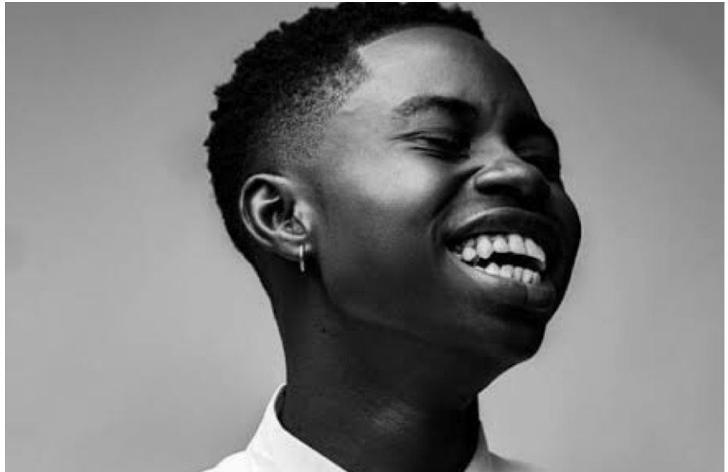
Big payouts from live sessions

The influencer explained that engagement plays a crucial role in his revenue. By interacting with viewers in real-time, he encourages more participation, which translates into higher earnings. He noted that fans send him gifts and virtual donations, which TikTok later monetizes.