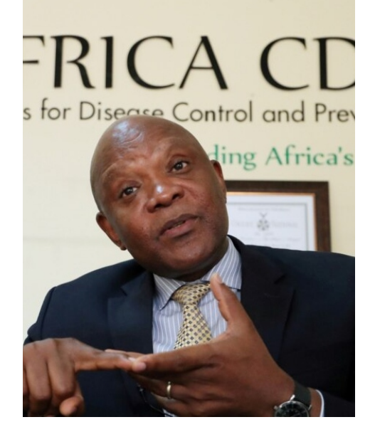
potentially losing billions of dollars annually and an additional 39 million people being pushed into poverty.

The human cost of such a setback would be staggering, with Africa