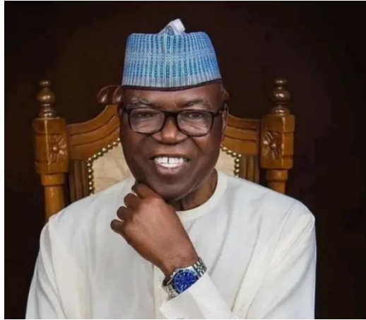
General Jeremiah Timbut Useni.

The governor's Director of Press and Public Affairs, Gyang Bere in a statement said, "The governor of Plateau State, Caleb Mutfwang, deeply regrets to announce to the citizens of Plateau State and all patriotic Nigerians, the passing of the former Minister of the Federal Capital Territory (FCT), Lt.