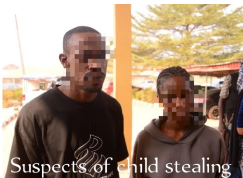
Suspects of child stealing