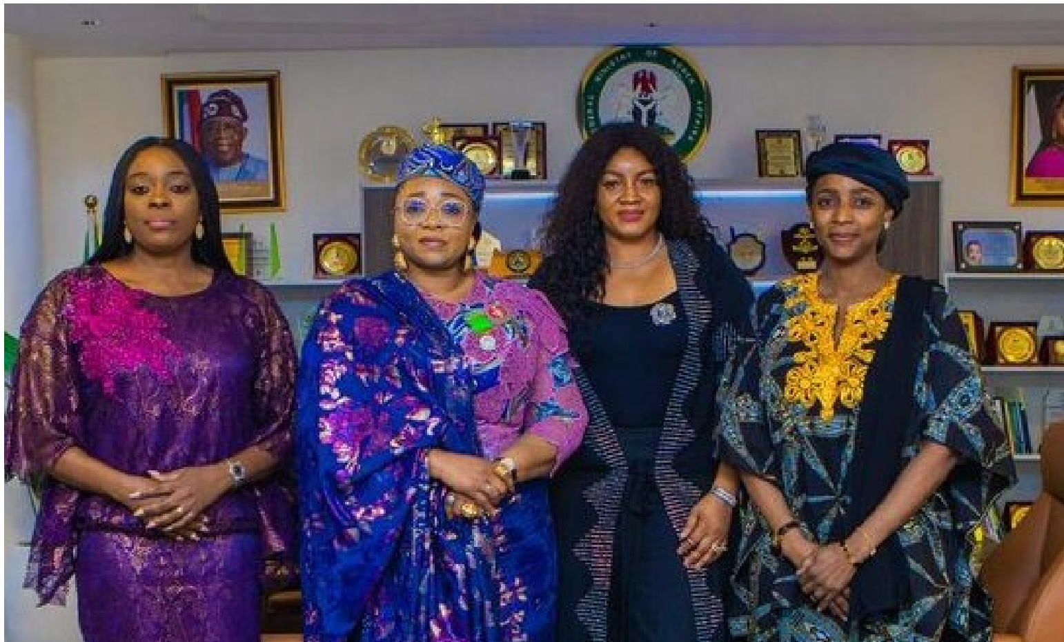
Jalade The Minister of Women Affairs, Imaan Sulaiman-Ibrahim, actress Omotola Jalade Ekeinde and others

In a groundbreaking initiative, the Minister of Women Affairs, Imaan Sulaiman-Ibrahim, has partnered with renowned actress Omotola Jalade Ekeinde to advance women's empowerment through cinematic arts.