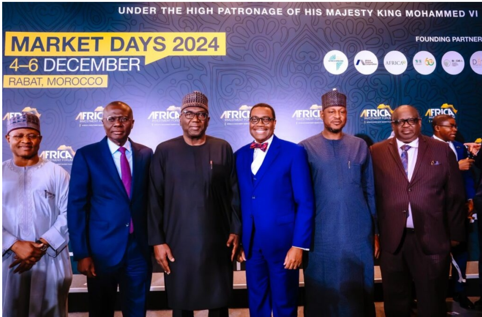
Nigeria (AfDB) The President of the African Development Bank (AfDB), Akinwumi Adesina

N igeria secured $7.6 billion in investment interests during the Africa Investment Forum 2024, held in Rabat, Morocco, from December 4 to 6, 2024.