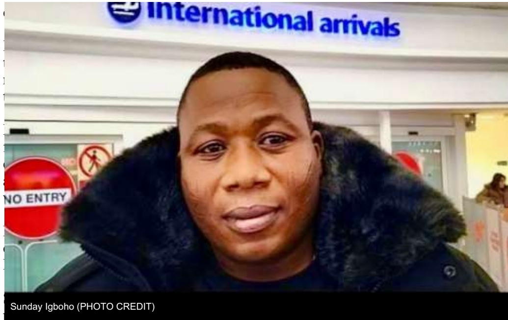
Sunday Igboho

In a viral video online on Thursday he expressed concerns over the declining sense of patriotism among Nigerians, citing corruption, insecurity, and