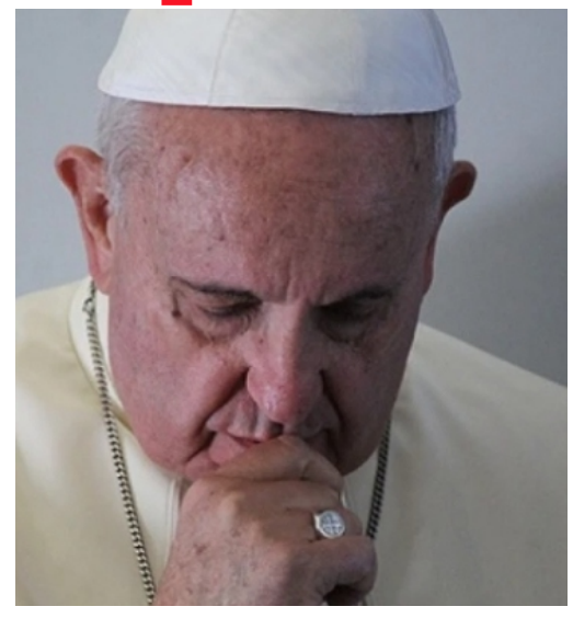
"I join in the prayer for the survivors and the dead," added the supreme pontiff, according to a statement from the Holy See's press office.

On Sunday noon, after praying the Angelus from the window of his study, in the Vatican Apostolic Palace, before more than 30,000 people gathered in St. Peter's Square, Francis said that "my thoughts are directed to the numerous families of South Korea who are today in mourning after the dramatic plane crash."