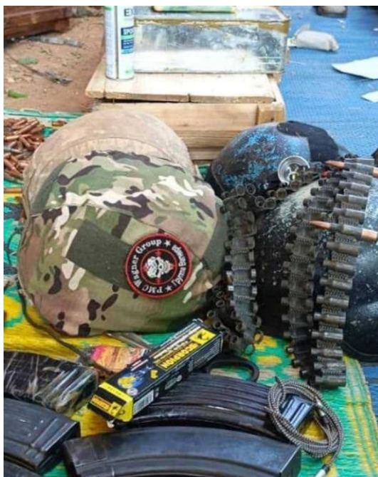
Islamic militants kill 5 Wagner mercenaries in Mali ambush

The JNIM has claimed responsibility for the assault, releasing graphic images and videos of the aftermath, further underscoring their operational presence in the area.