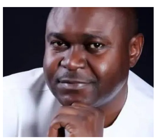
Enforcement Agencies and Disregard to the Rule of Law: A Menace to the Renewed Hope Agenda of His Excellency."

They were titled: "Complaint of Abuse of Power and Office by Security and