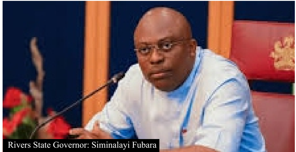
Rivers State Governor: Siminalayi Fubara

He particularly expressed delight to have joined with the family of the royal father to present their thanksgiving to God, as according to him, it aligns with