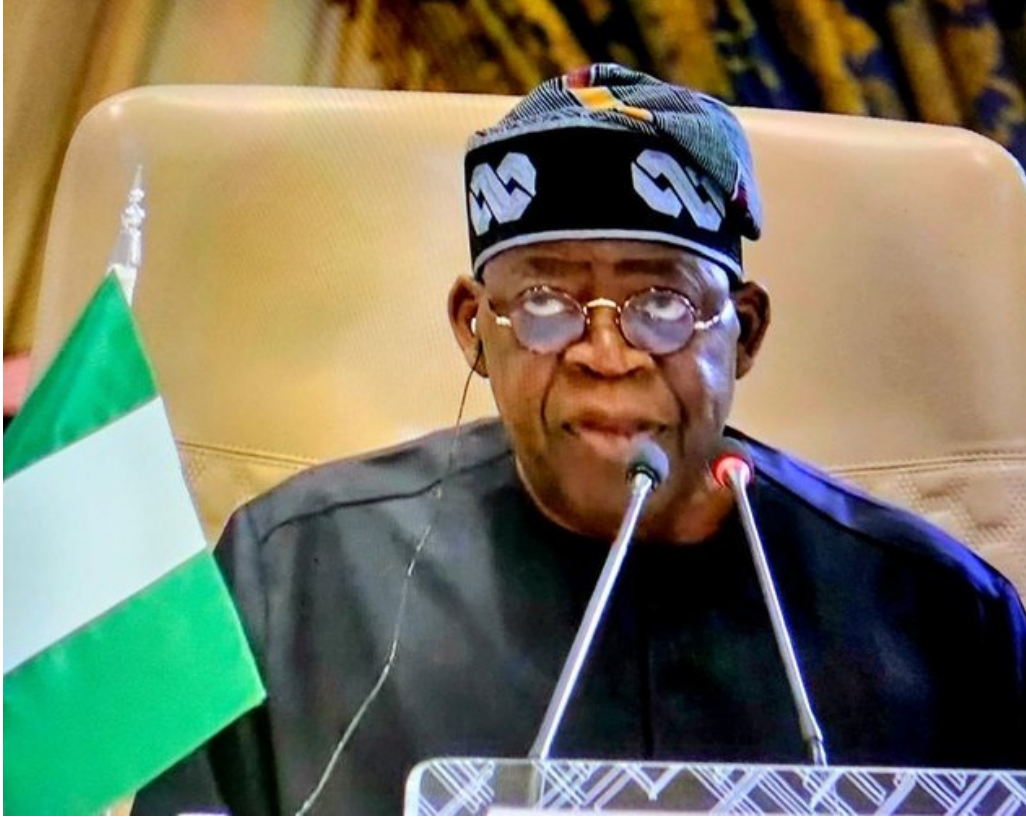
President Bola Tinubu while addressing the extraordinary Arab-Islamic Summit in Riyadh on Monday

opportunity to bring to bear new thinking on this most relentless challenge. We need to find new pathways to peace, without delay,” Tinubu said.