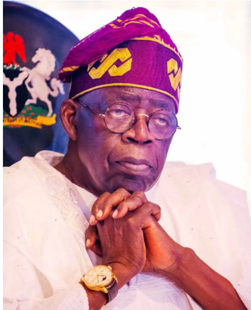
General Lagbaja served as the Chief of Army Staff from June 19, 2023, till his death on November 5, 2024.