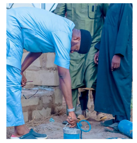
challenges and combat open defecation.

He characterised the water and smart toilet projects as crucial interventions designed to tackle rural water supply