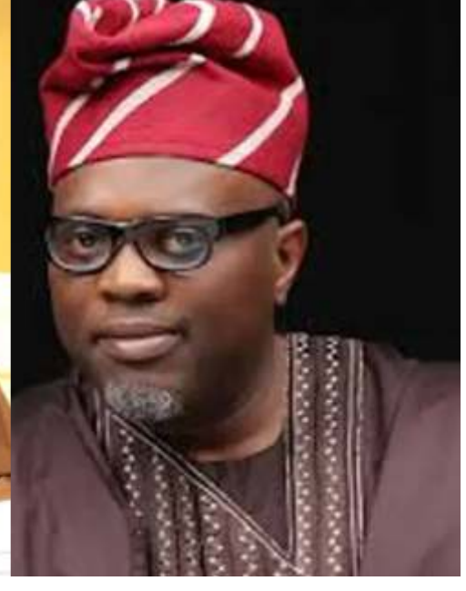
wage as of the latest reports.

However, he also highlighted that only 16 states had fully implemented the new