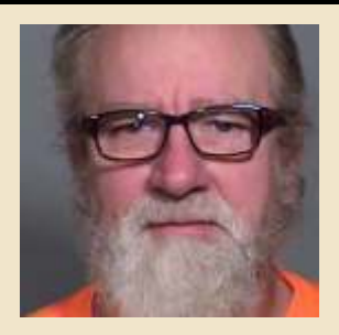
Arizona prisoner serving 16 life sentences kills 3 fellow inmates Pg 30

WORLD Pg 31 Musk's DOGE using AI to spy on federal workers