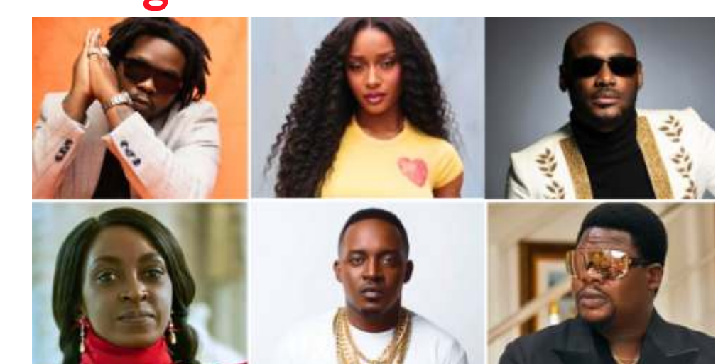
you," he concluded.

"To those we've lost: we will not forget you. To those still standing, we stand with