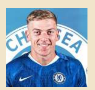
Chelsea agree deal for Liam Delap with £30m release clause Pg 21