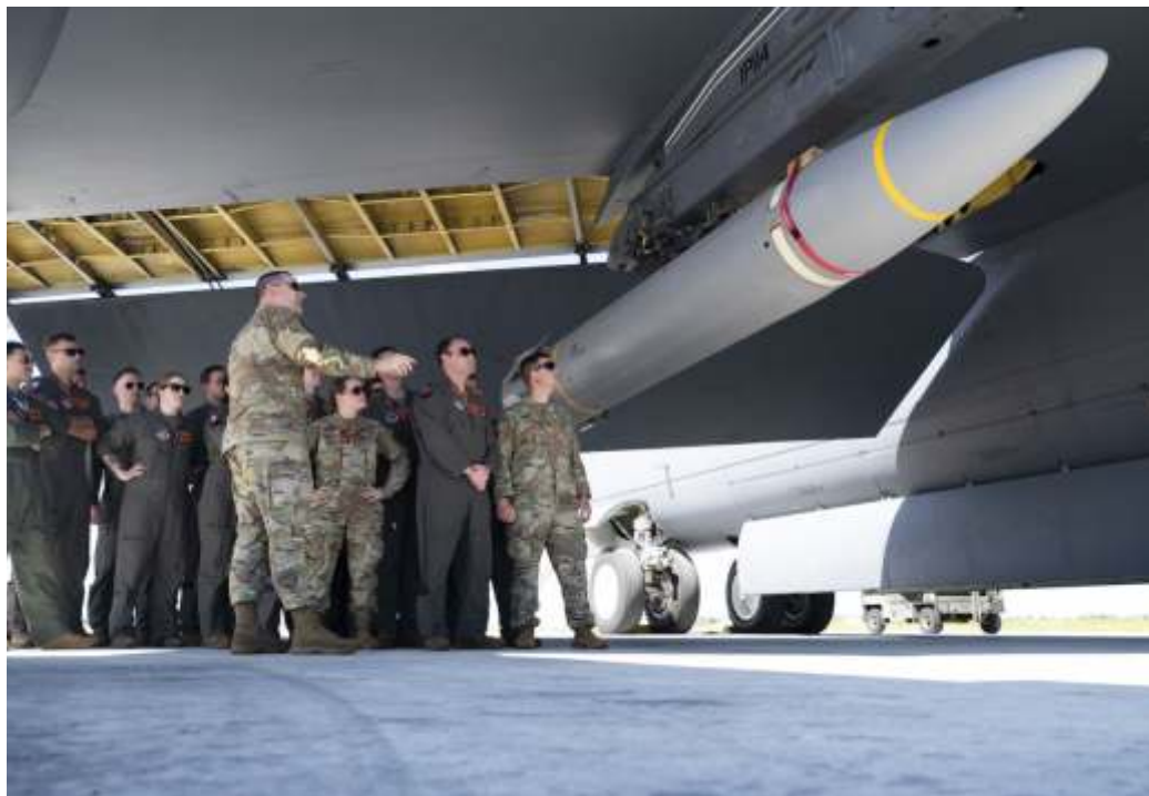
SME Gas Dynamics Ltd.

The testing was part of the UK's Hypersonic Weapons Programme, which took place over six weeks involving real-time data analysis to refine design aspects and boost propulsive performance, with support from industry partners including UK