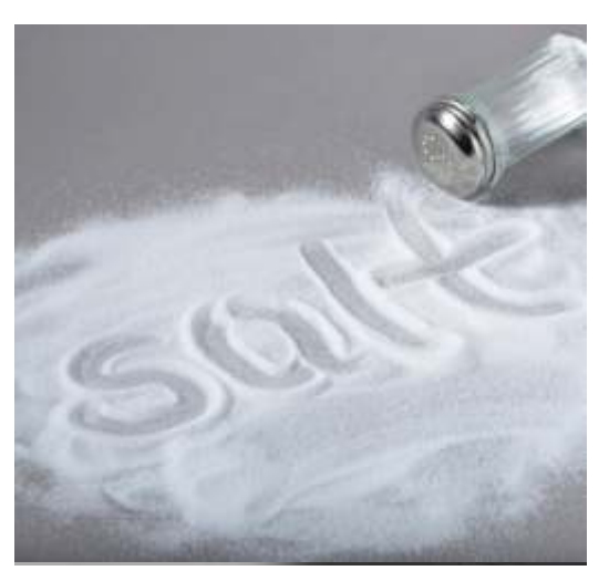
increase diabetes risk, study finds

One theory proposed by the researchers is that high salt consumption may disrupt