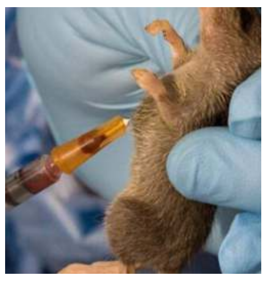
Delta (1), Cross River (1), and Ogun (1).

Others are Gombe (7), Benue (4), Nasarawa (4), Kaduna (2), Enugu (1),